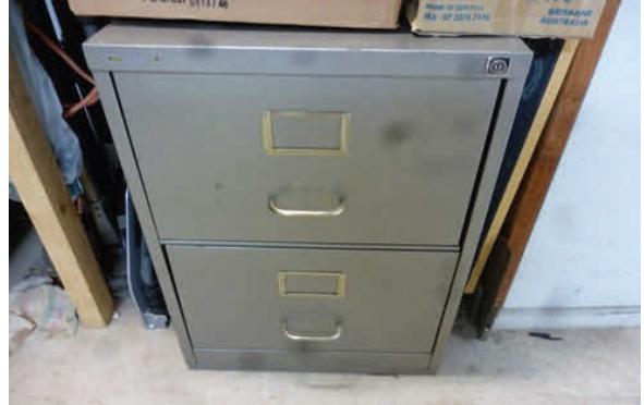
Standard Lockable Office Filing