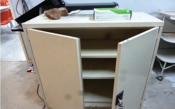
900mm long x 450mm deep x 1000mm high Cabinet

announced that night at the meeting . The letterbox will be emptied on the 25 th for the last bids to be received . Emails received after midday WILL NOT be considered .